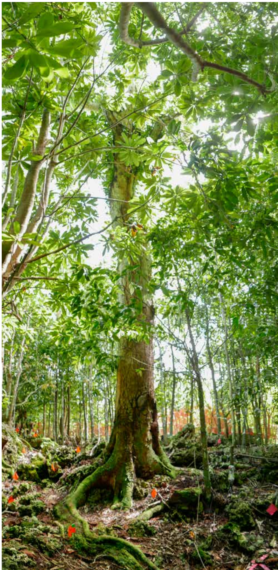
Serianthes nelsonii, also known as hayun lagu or tronkon guafi, is found only on Guam and Rota. This tree is the only remaining tree found on Guam. 'Hayun lagu' means northern tree as Guam residents refer to Rota located north of Guam and 'lagu' where a larger population of S. nelsonii has been found. 'Tronkon guafi' which means fire tree is commonly used by Rota residents.