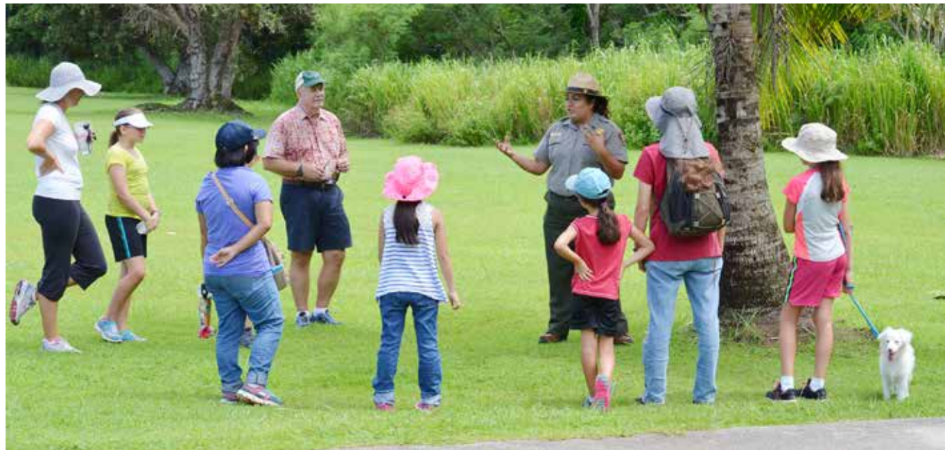
The long term goal of the "Every Kid in the Park" initiative is to inspire, educate, and grow a new generation of environmental ambassadors and stewards, ready to preserve and protect our public lands.

All events and park units at War in the Pacific National Historical Park are free (no free entrance) and open to the public. For more information on specific programs, call 671-333-4050 or visit www.nps.gov/wapa for more details and a map of park units.