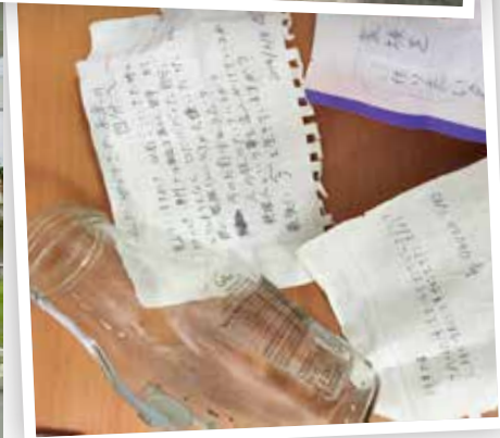
Above: Message in the bottle written in Japanese found at the Ypao Site.