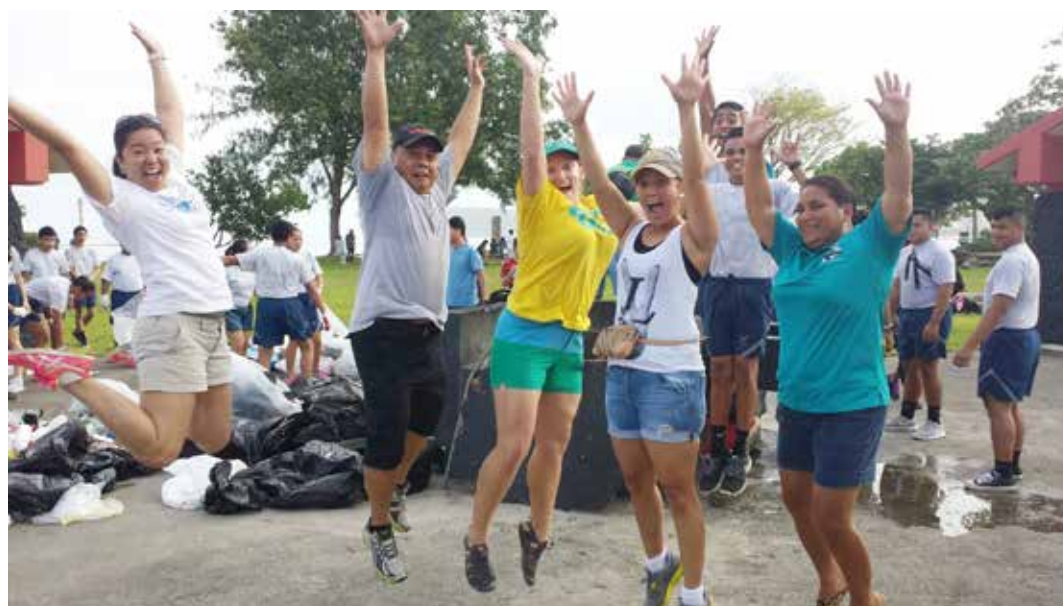
Right: Ypao Site Team jumping for joy with a successful cleanup!