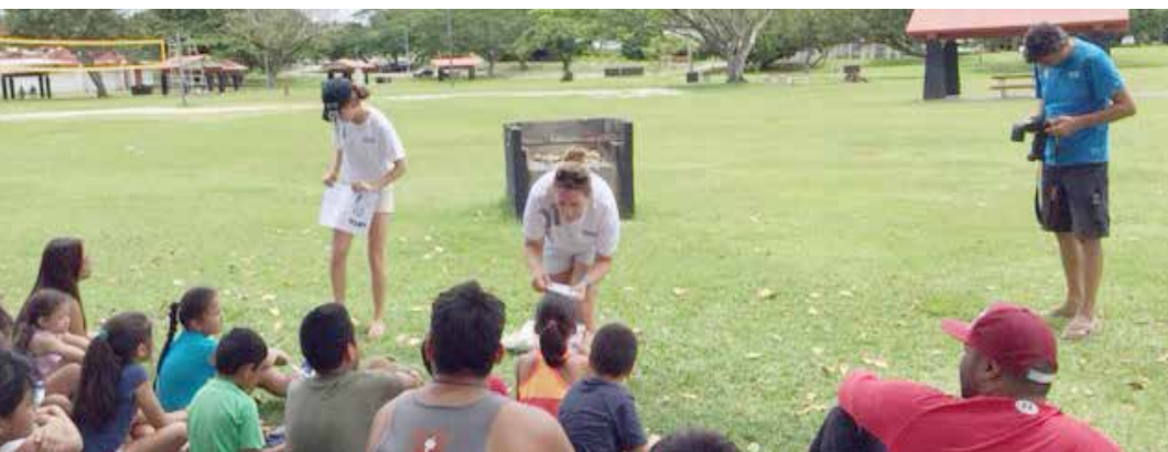
Campers listening to the Race for Water group regarding plastic and marine pollution.