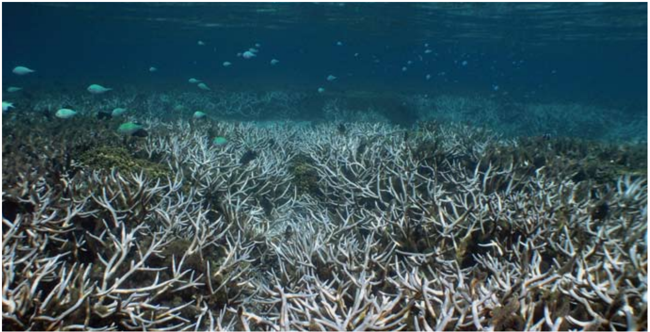
Bleached staghorn coral in the shallow waters of the Tumon Bay Marine Preserve.

5.4 Increase understanding of the causes of coral bleaching and disease-associated mortality on Guam and investigate approaches to stimulate recovery and rehabilitation.