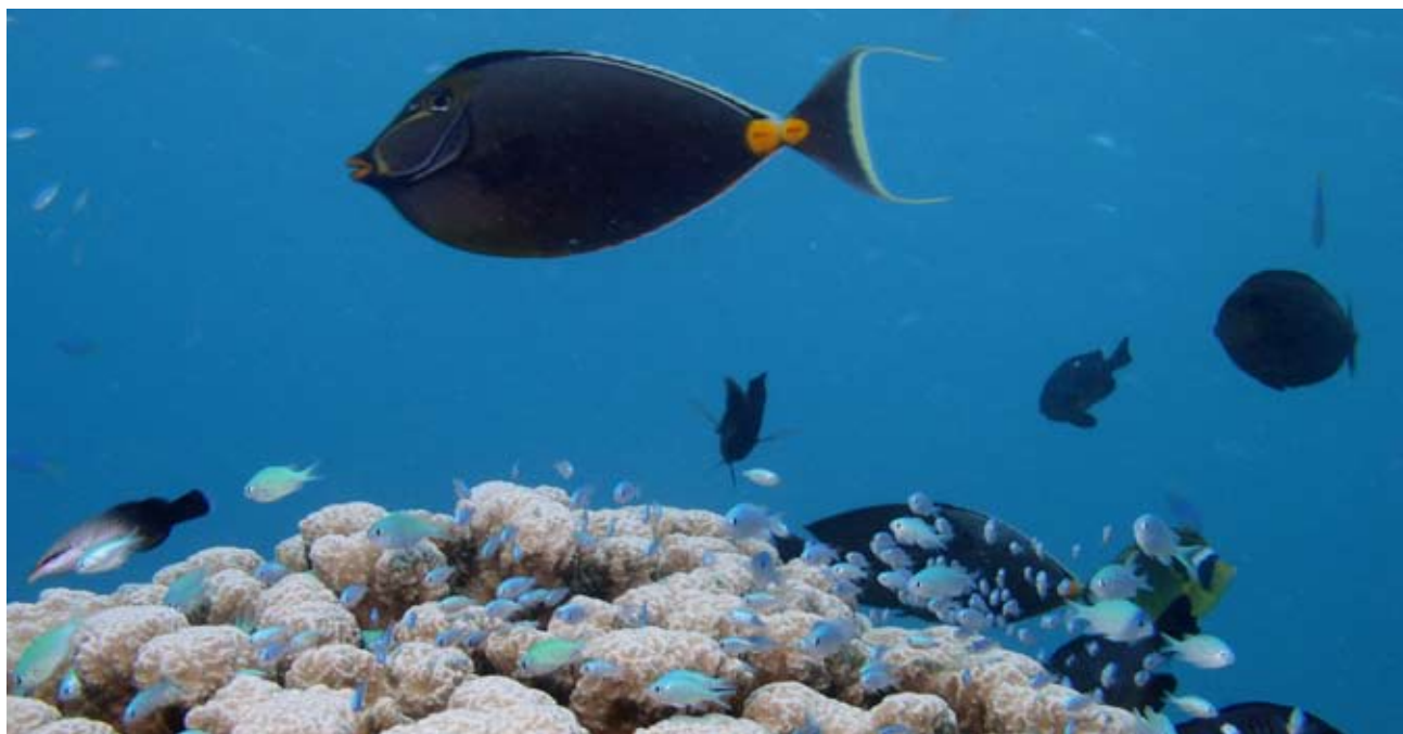
Marine preserves like Tumon Bay Marine Preserve are proven fishery management tools that increase the size of reef fish within and surrounding their borders.

and mitigation; improve accuracy of EFH consultations regarding proposed (fishing or non-fishing) impacts; improve quantification of habitat value/loss and mitigation recommendations; improve integrated ecosystem assessments (ecosystem-based fishery management).