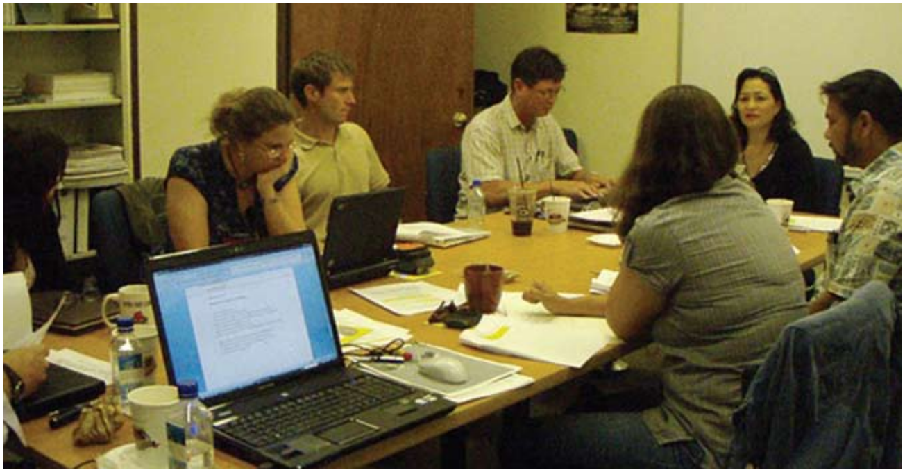
During the second day of the priority setting workshop, core managers met in small groups to identify specific actions to implement the agreed upon priority goals.