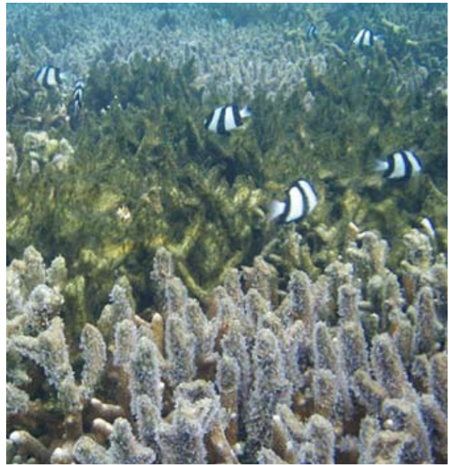
Left image: A reef community near Anaa Island, on the southwest coast of Guam, that is heavily impacted by regular sedimentation events. Right image: Algae growth associated with nutrient-rich runoff overgrows coral in Tumon Bay.

projects designated as high priority by 2011.