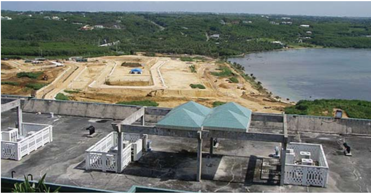
Development activities are increasing in anticipation of the military build-up in Guam. It is important that proper mitigation planning is set in place when impacts to coral ecosystems can not be avoided.