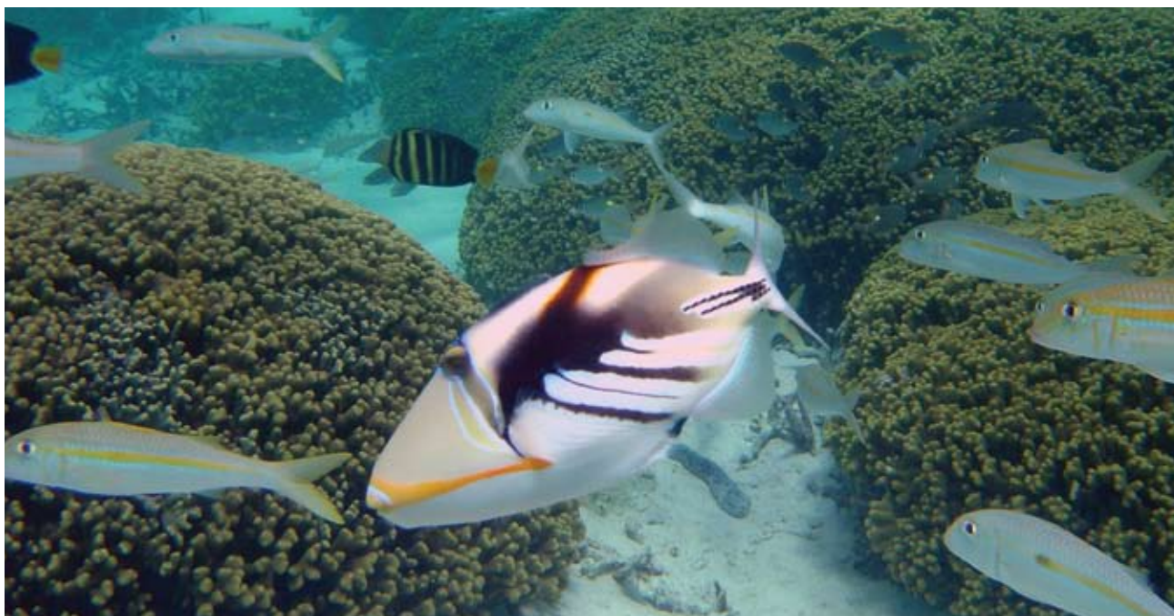
Healthy coral reefs provide important habitat for reef fish.