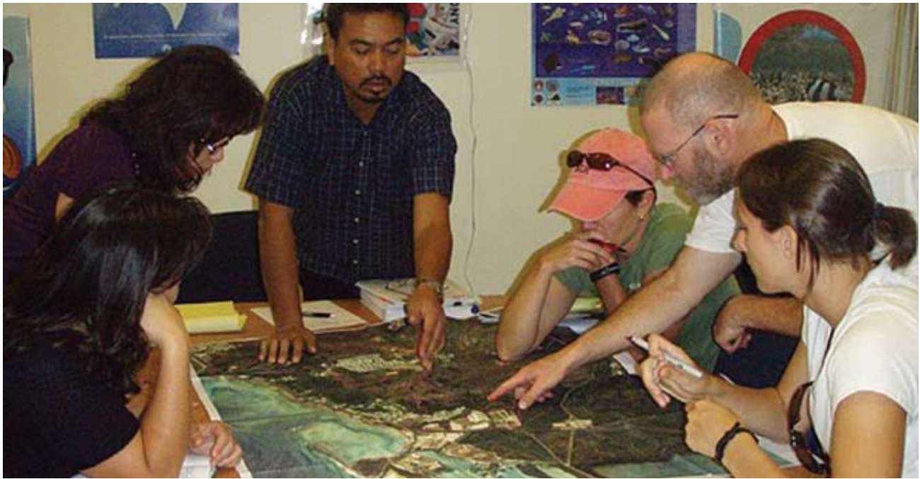
Scoping conducted to identify stormwater retrofit opportunities; stormwater management is a tool in managing runoff.