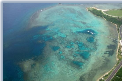
Figure 2: Fish Eye Marine Park located within the Piti Bomb Holes Marine Preserve

Guam Department of Agriculture's Conservation Officers are responsible for enforcing the island's natural resource regulations. Signs posted at each of the marine preserves outline the laws and regulations of that preserve. Violators of marine preserve regulations are subject to fines up to $500, or imprisonment up to 90 days.