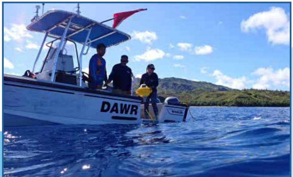
Guam Department of Agriculture's Division of Aquatic and Wildlife Resources (DAWR) assisted GCMP with vessel support and logistics for the deployment of the first of two Southern Backyard Buoys.

and the Guam Police Department to deploy the two buoys, both of which should be in the water before the end of July. We are collaborating with various agencies and organizations willing to assist with