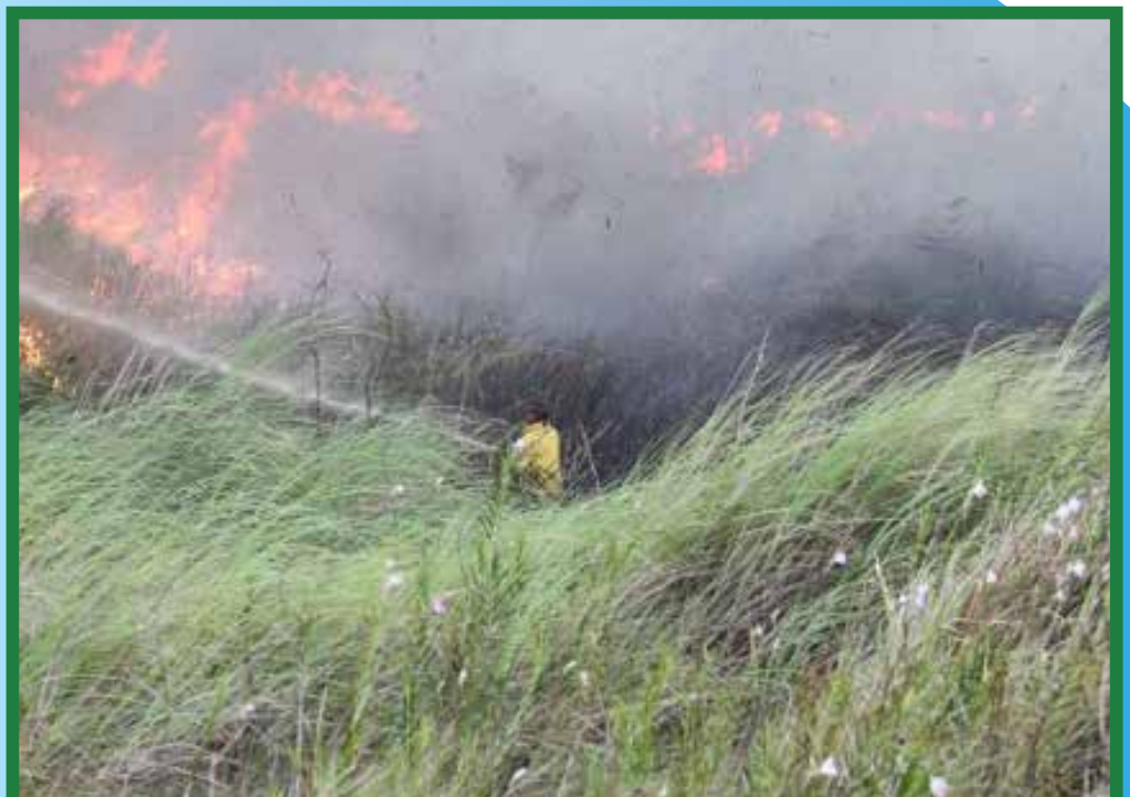
A local firefighter battles a wildfire in Southern Guam. Local agencies met for Guam's First Wildfire Tabletop Exercise to strengthen coordination around wildland fire preparedness and recovery.