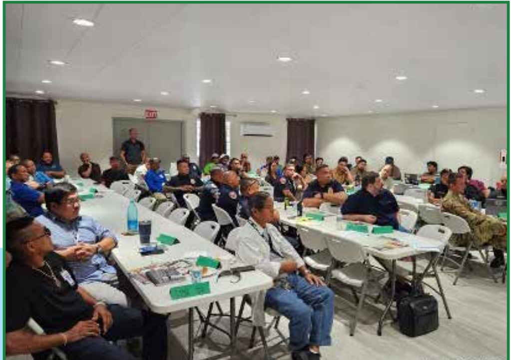
Morning session of DOAG-FSRD's First Wildfire Tabletop. Partners included are as follows: DPW, Yona Mayor's Office, Mangilao Mayor's Office, NavFac-Marianas, NWS, Guam Fire Department, AAFB Fire, JRM Fire, BSP-GCMP, and USACE.

The afternoon session transitioned into post fire recovery and fire season preparation. Discussions included mitigation strategies, outreach, equipment needs, and interagency training opportunities. A key concern raised was the prevalence of auto and trash fires, with MCOG noting limited capacity to address illegal dumping and abandoned vehicles. Department of Public Works (DPW) clarified its role in clearing abandoned vehicles from numbered highways but acknowledged ongoing issues on village and private roads. DOAG-FSRD emphasized its support for recovery tree planting through the Forest Stewardship and Urban and Community Forestry programs, and offered technical guidance on tree species selection. North and South Soil and Water Conservation Districts (SWCD) encouraged deeper collaboration with MCOG to enhance restoration efforts. DOAG-FSRD also committed to sharing a training calendar to support partner agencies. Additional recommendations included installing fire danger rating boards in more visible public areas and collaborating with NWS to create age-appropriate fire weather messaging that aligns with local Smokey Bear outreach.