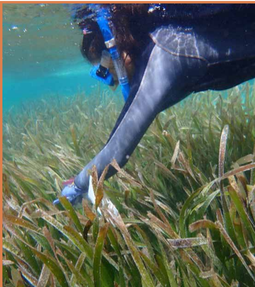
Stephanie gathers seagrass samples while snorkeling.

Although studying seagrass disease may seem oddly specific, seagrasses are an important contributor to life in Guam. Seagrasses form lush meadows that are home to mafute', mañahak, and other marine life such as snails and slugs that support local fisheries. As waves roll over the reef and through the tall seagrass, the leaves sway back and forth, absorbing the energy of the wave and keeping in shore waters calm. Smaller seagrasses also spread roots through the sediment and help keep it in place, preventing erosion and helping to keep the water clear. With additional research, scientists and managers hope to better understand what is impacting our seagrass and how to take action to protect them. Sharing information can also help us collaborate better among islands, the tropical Pacific, and research labs. Andrew Kang presented on seagrass disease as part of the national NIH STEP-UP symposium last August, and both Andrew and Kylie Naguit shared their findings at the 2025 Marianas Islands Conservation Conference.