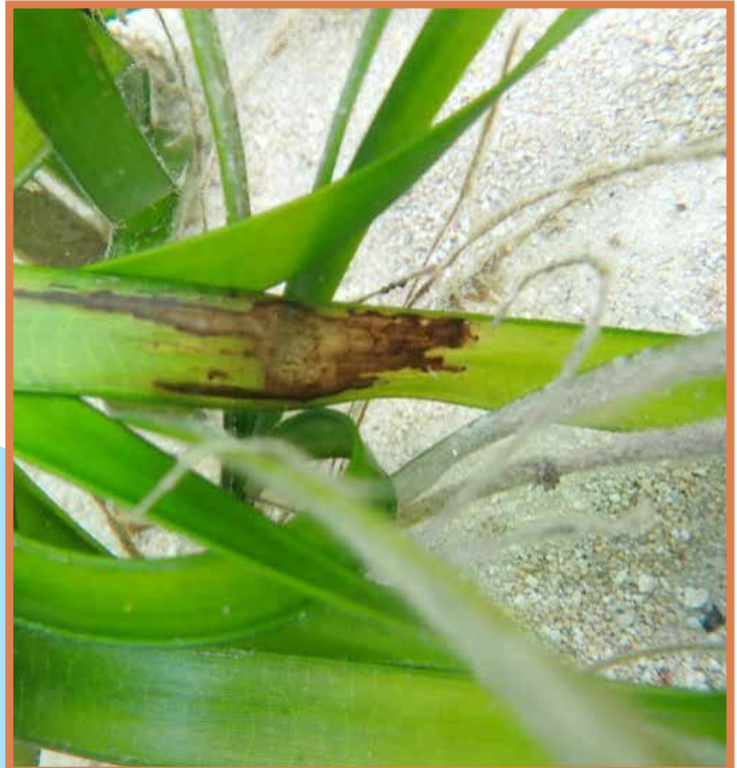
A seagrass leaf with a dark splotch suspected to be seagrass-wasting disease.